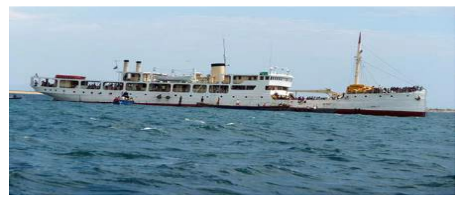
MV Liemba in Lake Tanganyika

Marine transport plays a significant role in transporting passengers and cargo along the shores of Lake Tanganyika and Lake Rukwa. Two commercial ships (Mwongozo and Liemba) operate on Lake Tanganyika and serve the villages/centres of Kabwe, Korongwe, Ninde, Wampembe, Kala, Kirando, Kipili and Kasanga. However, they are not reliable. With exception of Kasanga where there is a landing platform, ships are forced to anchor some distance from the shore (about I to I.5 nautical miles) therefore cargo and passengers are transported by small boats to the ships. Marine services link the region with neighbouring Regions of Katavi and Kigoma as well as neighbouring countries of Zambia, Congo DR and Burundi. Transportation within Lake Rukwa is only by boats.