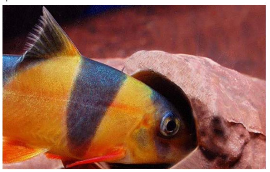
Ornamental Fish from Lake Tanganyika

The region is endowed with two major lakes (Lake Tanganyika and Lake Rukwa). There are other small lakes and rivers all with reliable fish population. The variety of fish available in the region includes Sardines, Tilapia, Nile perch, Mud fish, English fish, Luciolates, Strapessil "Migebuka" and various ornamental fish species.