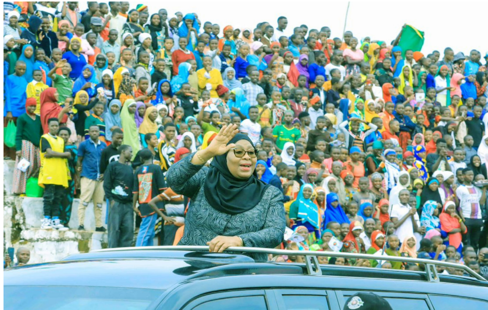
RAIS WA JAMHURI YA MUUNGANO WA TANZANIA, MHE. DKT. SAMIA SULUHU HASSAN AKISALIMIANA NA WANANCHI WA KIGOMA KATIKA UWANJA WA MICHEZO WA LAKE TANGANYIKA WAKATI AKIHITIMISHA ZIARA YAKE YA KIKAZI MKOANI HUMO