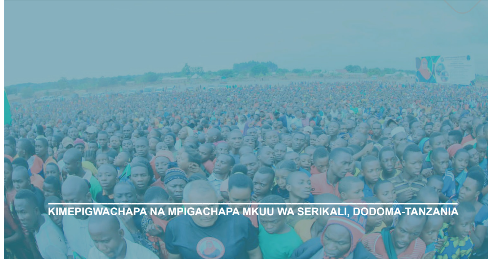
KIMEPIGWACHAPA NA MPIGACHAPA MKUU WA SERIKALI, DODOMA-TANZANIA