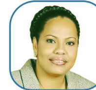
Mhe. Angellah J. Kairuki (Mb) Waziri wa Nchi OR - TAMISEMI